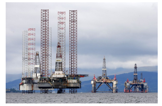
A U.K. oil-drilling unit in the North Sea operated by Transocean Ltd., whose stock has surged 23% this month.

Sector is S&P 500's best performer of year as oil rallies, investors bet shares are undervalued